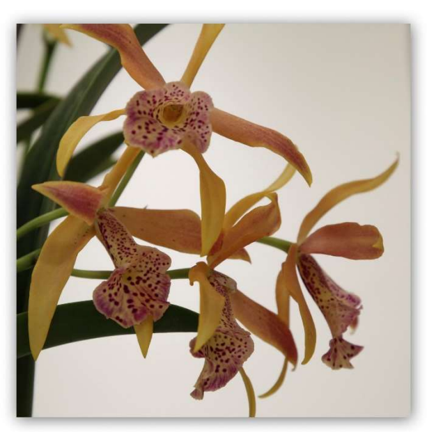
Advanced: 3rd Place BL Sunset Glory Grown by Phyllis Arthur