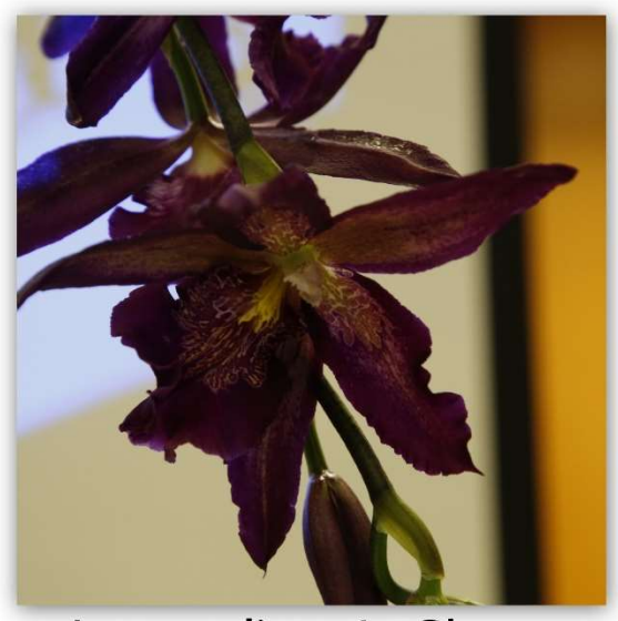
Intermediate: 1st Place Noname Grown by Jeannette Bean